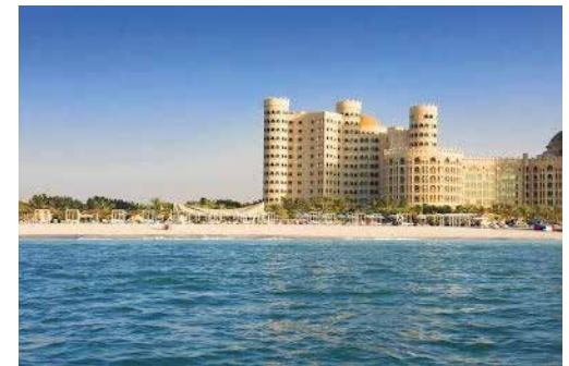
Alhamra residence and village hotel